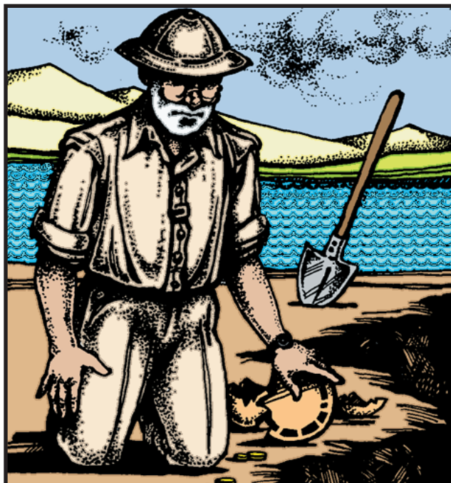
Digging to Learn about the Past

“I thought it might make our work more interesting to you if I pretended that one of the houses belonged to Peter and his wife and the other house to friends of Peter’s. Let’s pretend that the little girl in the house next to Peter’s kept a diary . We will call the little girl Hali . I will write to you what I think Hali might have written in her diary. Her diary might have been written on a scroll. Many people wrote on scrolls in Jesus’ day. Hali might have written her diary this way: