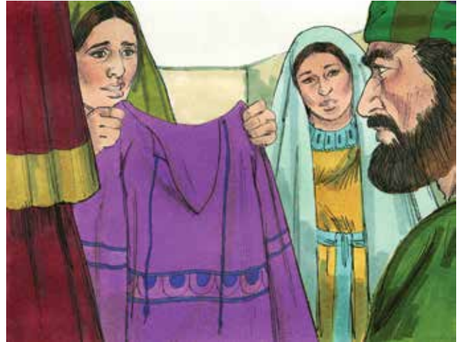
| Paul Speaking to Lydia

Paul was so concerned about the continued spiritual welfare of this first European convert,