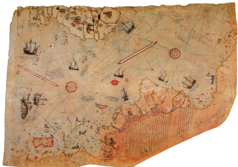
A map of the Atlantic from about 1513. Some early explorers may have used this map.

Maps. The best map of the earth is a globe . It is the same shape as the earth, a sphere . Any flat map, like the one on page 3, makes parts of the earth look the wrong size or difficult to see, but flat maps can be used to find places and features. Use the map to review some of the features and map lines on our earth.