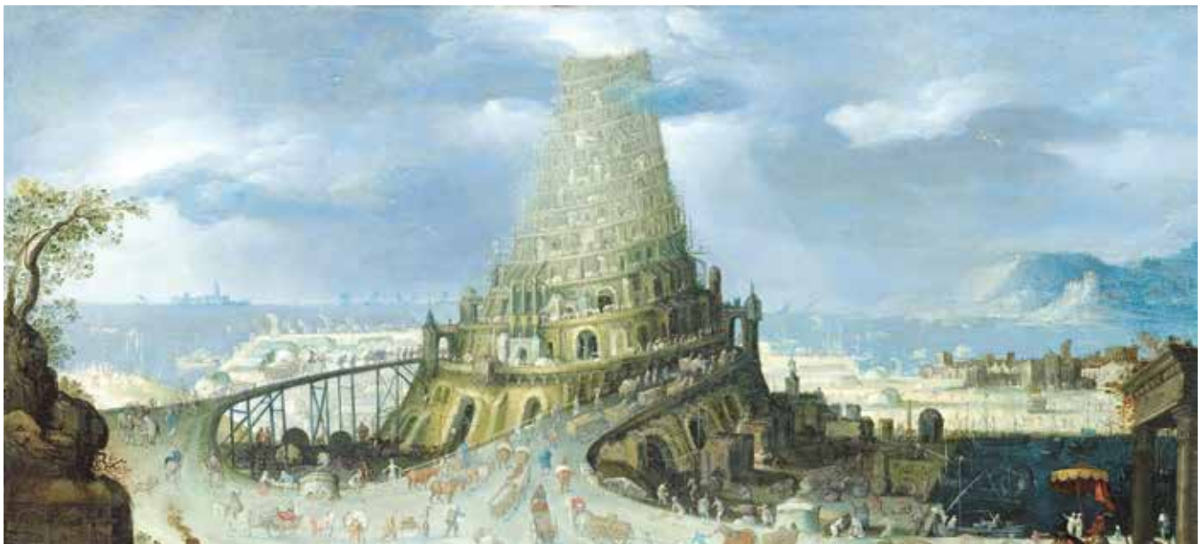
| The Tower of Babel

Read Ephesians 6:10–19. This Scripture tells about the armor of God and how it protects us from the wiles of the devil. The armor protects you from the devil who walks about “like a roaring lion, seeking whom he may devour.” (1 Peter 5:8).