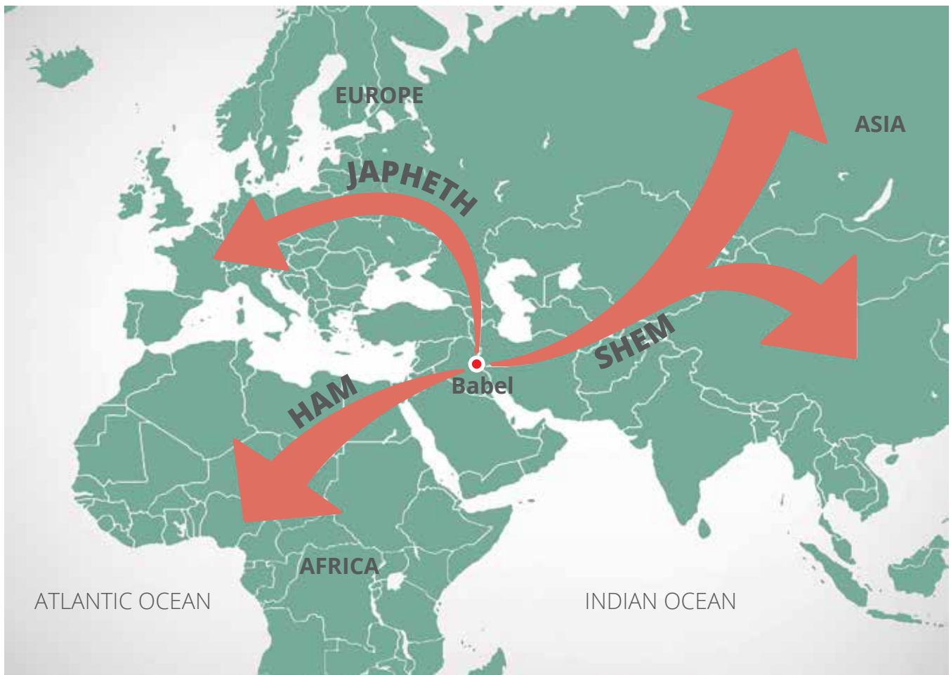
| Migration Routes from Babel

God knew that their plan to build such a one-world city was a challenge to His authority.