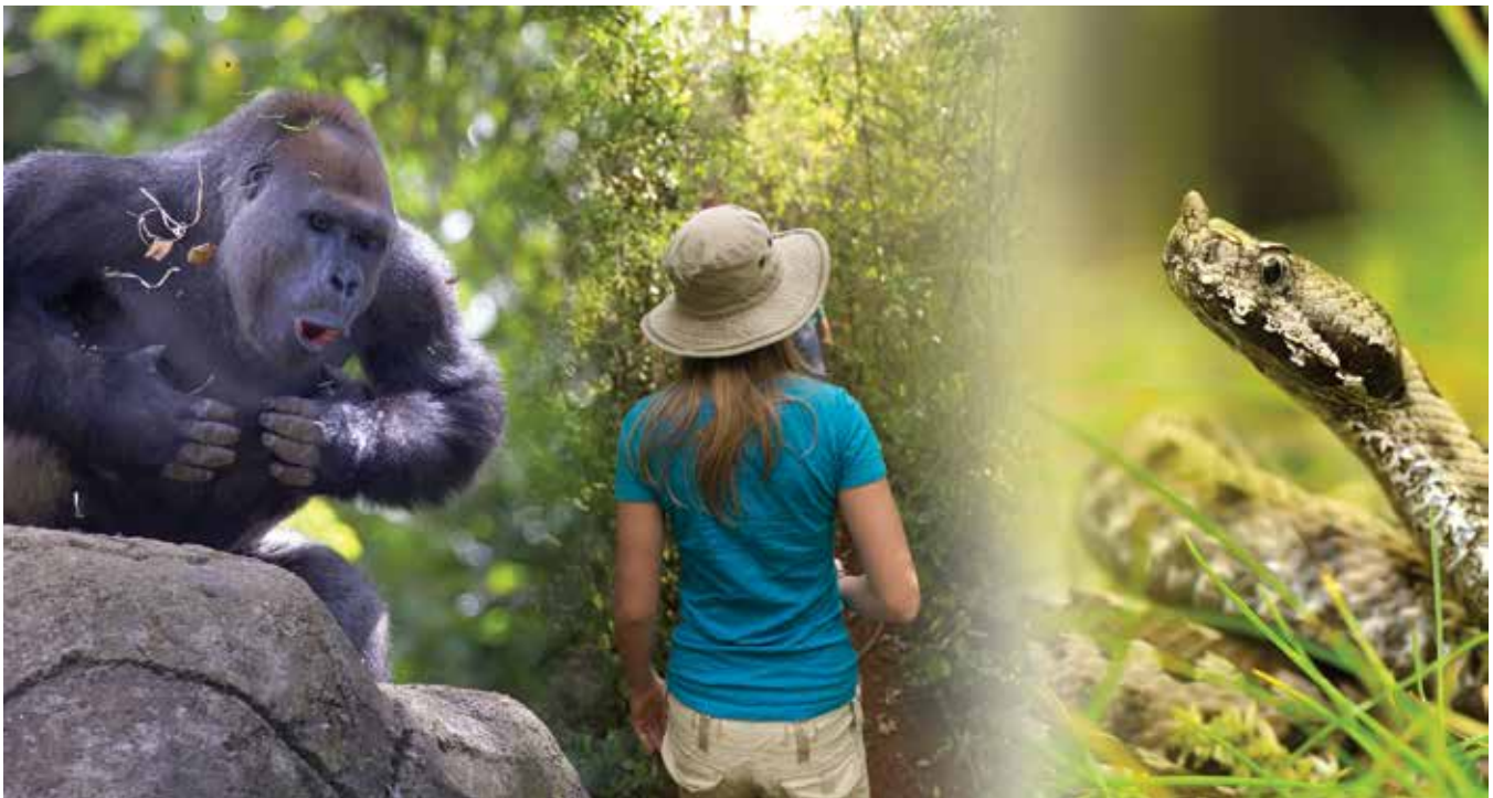
| ʒHu gèrl is in dīr per' ul.

The diacritical marks that indicate stress are as important as those for consonant and vowel sounds. If you say re tis' unt instead of re' tu sent or ep' i tōm instead of i pit' u mē , you will not make a good impression on your listeners. You should not use a new word until you have looked it up in your dictionary. If more than one pronunciation is given, you will be safe using the first one. Do not assume however, that because a certain pronunciation is given first, that the second or even the third is wrong or less desirable.